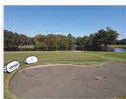
Mt Cooloolm Golf Club