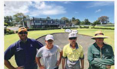
Mackay Golf Club

Capillary Bunkers not only rapidly drain rain from storms, but also moves moisture back up to the bunker sand during drier weather through special micropores and capillary action. The patented Capillary Bunkers system stores and restores moisture to the sand faces to provide more ideal playing conditions. In addition, Capillary Bunkers is the only product on the market that has a 1000 psi rating in ASTM testing protocols and can withstand severe climates and frozen ground. No other product comes close to this rating.