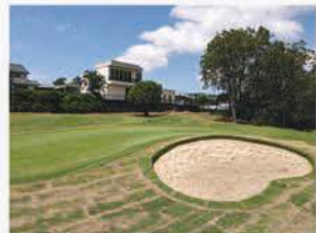
Pacific Golf Club

With the early success of Capillary Bunkers and EcoBunker installation at the Pacific Golf Club, Hervey Bay Golf Club, Mackay Golf Club and Toowoomba Middle Ridge Golf Club, Centaur Australia has heard compliments from all clubs and with their testimonies and approval, we received enquiries from many other clubs on their interest.