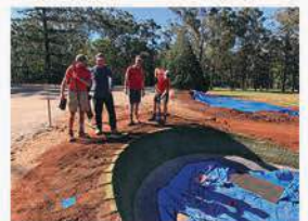
Toowoomba Middle Ridge Golf Club

At Cairns Golf Club, there was 20mm of rain in just 30 mins and the bunkers installed with Capillary Bunker were probably the driest place on the golf courses. With another 50mm of rain overnight and 30mm in one hour at the Pacific Golf Club, these untouched Capillary Bunkers prove the winning formula, reducing washouts and eliminating plugged balls.