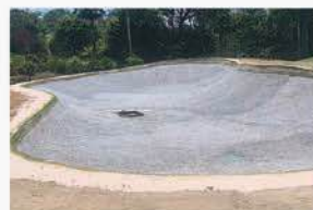
Cairns Golf Club

In the 4th quarter of 2022, Centaur Australia continued to install Capillary Bunker and EcoBunker in Cairns Golf Club, Indooroopilly Golf Club and Mt. Cooloolm Golf Club.