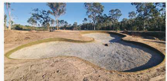
Hervey Bay Golf Club