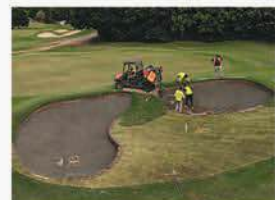
Indooroopilly Golf Club

When combine with Loksand, a sand stabilisation fibre. We believed that they would achieve the best results for your bunkers.