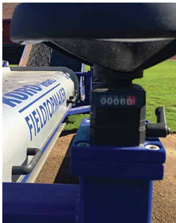
Depth setting is accurate to 0.1mm, via a digital display read out