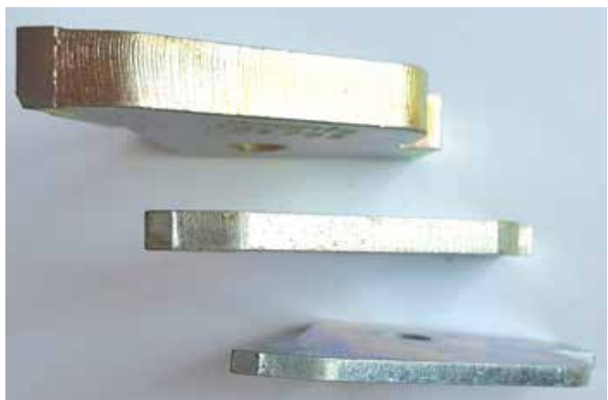
10mm, 5mm and 3mm blades

All 3 blades can be used on natural turf, on both cool and warm season grasses for Koro Universe ® Finesse Mowing, or Koro Universe ® Frazee Mowing.