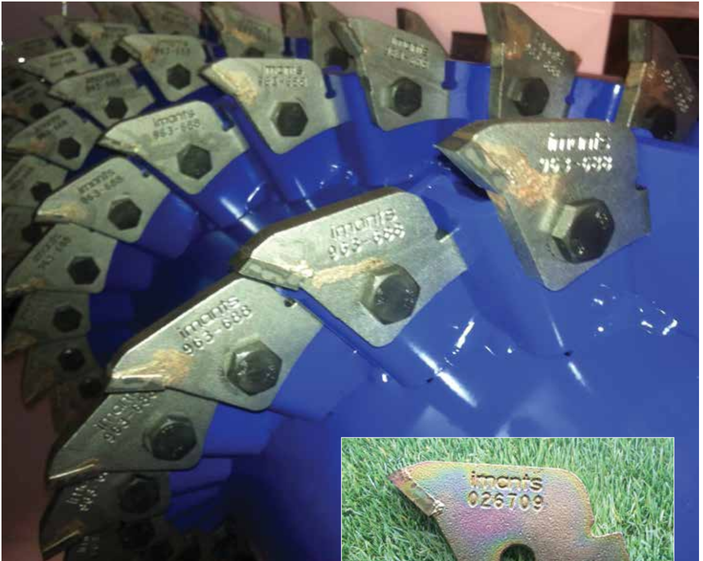
10mm tungsten tipped blades in 4 spiral Universe ® rotor configuration

2012 / 2013 saw the introduction of 2 new rotors for the Koro FTM; Universe ® and Terraplane ® . The first blades designed for the Universe ® rotor were 10mm.