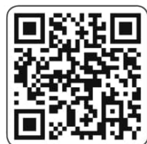
MSDS QR CODE