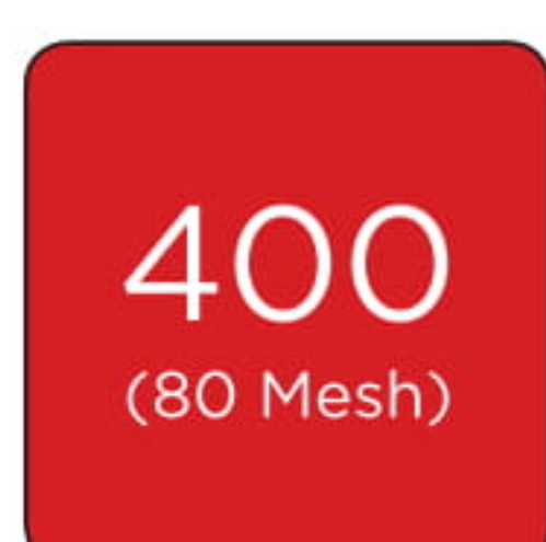
NOZZLE COLOUR FOR OPTIMUM WATER RATE

Stabilised nitrogen fertiliser with Iron and magnesium assisting in the production of excess chlorophyll, giving a longer-lasting deep green appearance and growth in quality turfgrass. The nitrogen is stabilised using UMAXX Technology.